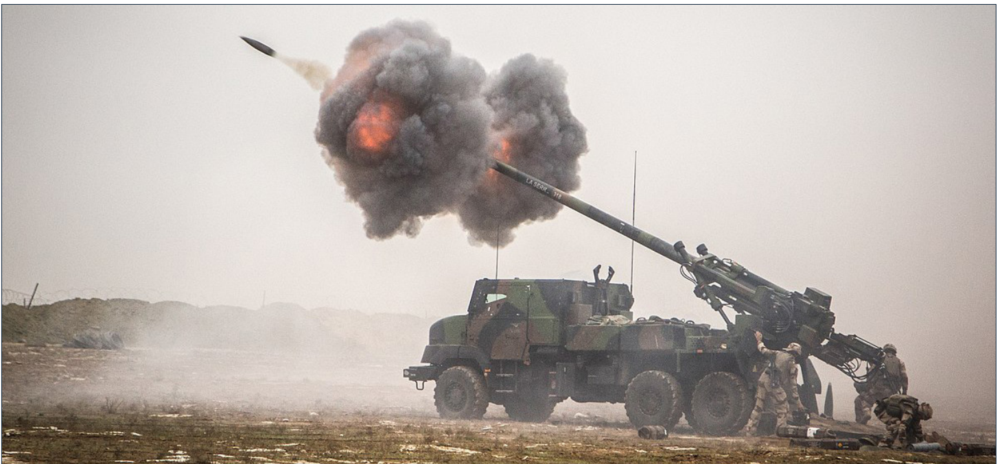
French Caesar self-propelled howitzer fires into the Middle Euphrates River Valley, 2 December 2018.

“Yerevan and Paris signed a contract for the supply of Caesar self-propelled artillery units, French Defense Minister Sebastien Lecornu said.”