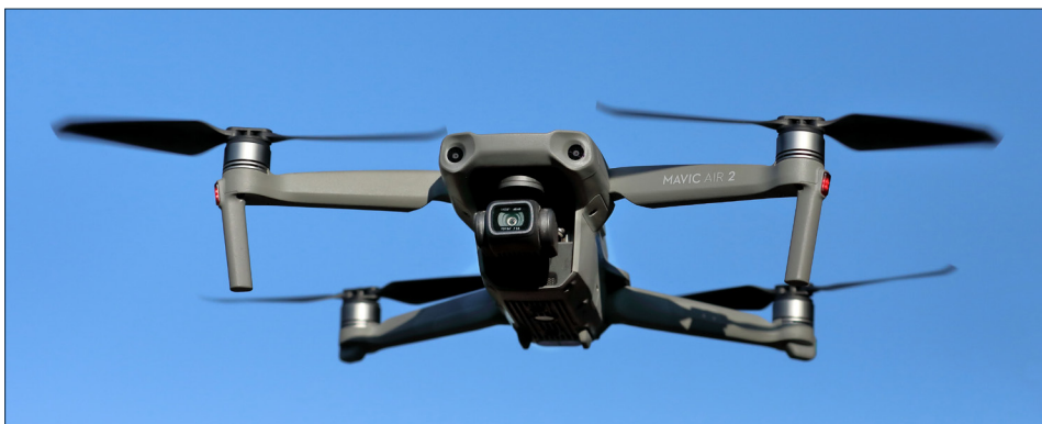
▲ China's DJI Mavic Air 2 drone in flight.