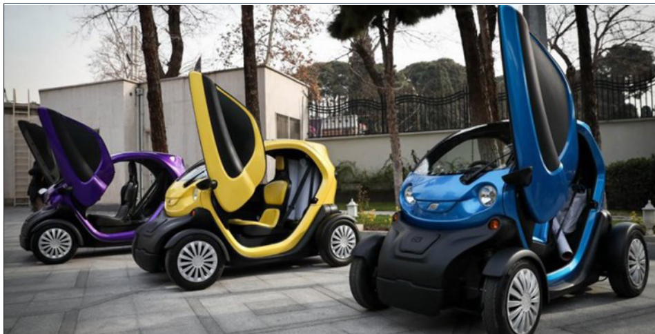
The Yuz, Iran's domestically-manufactured electric vehicle, unveiled in November 2021.

The significance of the report is not so much a continuing emphasis on the development of electric vehicles, an item the Iranian press began reporting upon in November 2021, 2