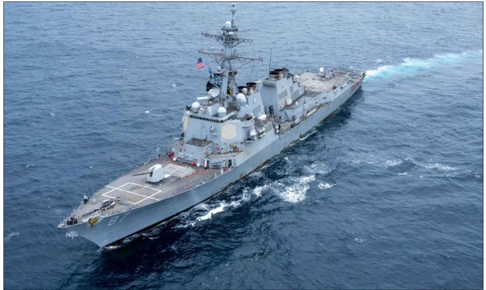
The Arleigh Burke-class guided-missile destroyer USS Mason (DDG 87), sails in the Red Sea in support of Operation Prosperity Guardian (OPG) 31 January 2024.

Arabic-language media analysts and commentators widely agree that the U.S.-led Operation Prosperity Guardian—formed in December 2023 to address Houthi attacks on vessels in the Red Sea—has not effectively deterred Yemen’s Houthis from targeting commercial maritime traffic. 1 However, they are divided on whether this failure is due to deliberate strategic choices or poor planning. 2 Some commentators suggest that the real target of the operation is China, not the Houthis. They argue that the United States may be intentionally allowing Houthi attacks to weaken China economically and justify military presence in a region with increasing Chinese naval activity. The first excerpt, from the Saudi daily al-Sharq al-Awsat , reflects this view, with several Yemeni political analysts indicating that the United States is colluding with the Houthis for a broader strategic aim. 3 This perspective, however, is not universally accepted across the region. Pro-Houthi media outlets, for example, attribute the lack of deterrence to Yemeni strength and U.S. shortcomings. The second excerpt, from the Houthi news website al-Masirah , illustrates the Houthi narrative on Prosperity Guardian, whereby Yemeni forces have shattered U.S. military prestige