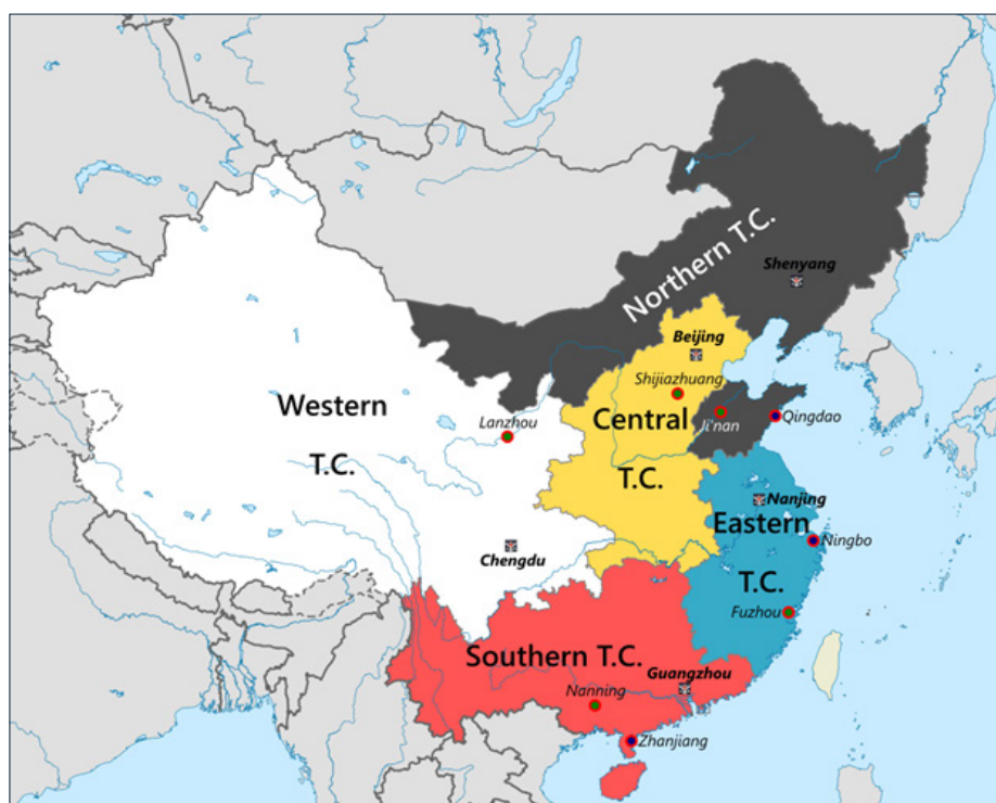
Map of China's five Theater Commands. The Southern Theater Command has responsibility for the borders all countries and coastline touched by its jurisdiction.

The third excerpted article from Xinhua and published on Chinese military-focused news aggregator Chinamilitary.com noted that in addition to border security and continued operations in the South China Sea, the Southern Theater Command is frequently tasked to help with natural disasters such as the participation of 700 PLA Army personal to assist in the response to flooding in central China's Hunan Province in July.