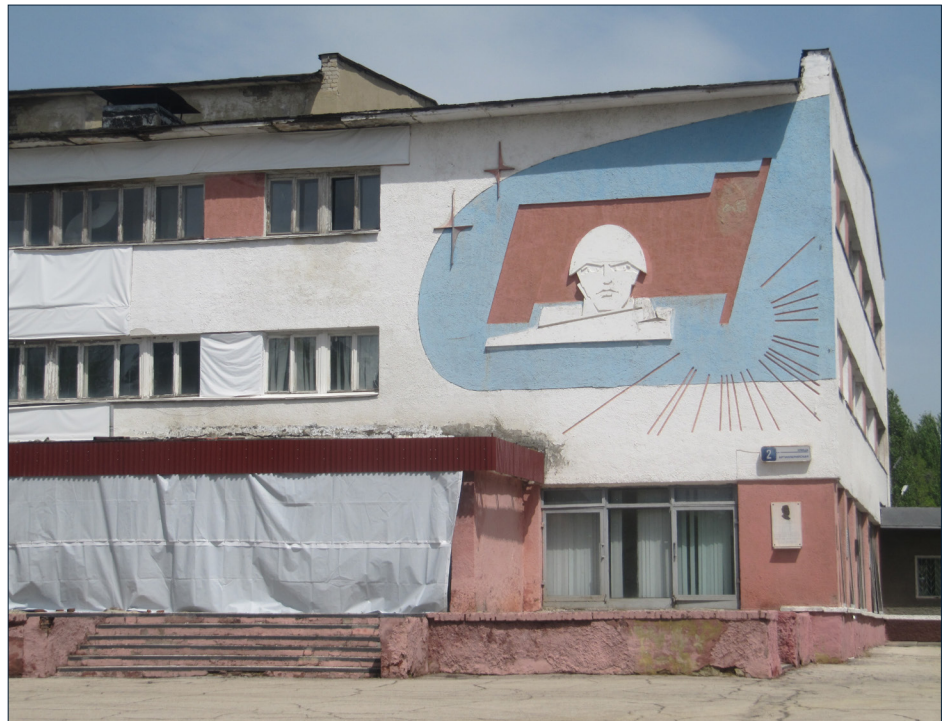
Saratov Higher Artillery Command School.

Russian newspaper Izvestiya, discusses how Russia is reopening military officer academies to support an expansion of the force that will likely not be fully implemented until well after the special military operation ends.