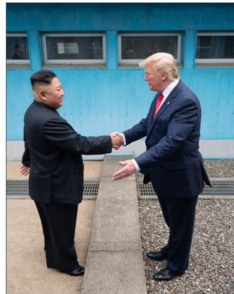
North Korean Leader Kim Jong Un meets U.S. President Trump in the Joint Security Area of the Demilitarized Zone (2019).

As the U.S. election approaches, North Korea is likely to issue messages from increasingly authoritative sources within the party's hierarchy, such as Kim Jong Un's sister Kim Yo Jung or ultimately Kim Jong Un himself. As a rule, the more authoritative the source, the less ambiguity in the North's course of action and the more likely that the statement represents Pyongyang's preferences or plans. Although it will be somewhat flexible on the scale, before agreeing to even sit down with the United States, Pyongyang, at minimum, is likely to